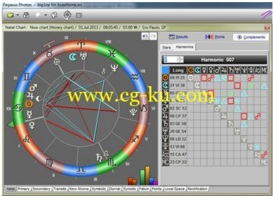
Pegasus Photon 8.4B